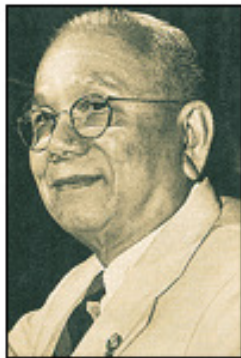
Aw Boon Haw